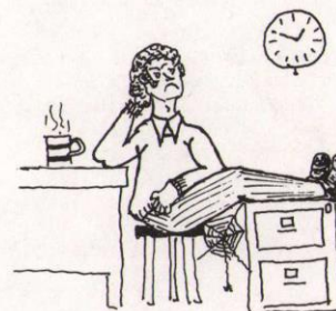
The one that got away.

Anyone interested should contact Ken Paler on Ext 6108.