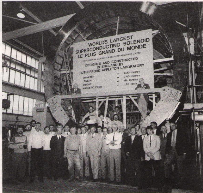
The DELPHI Solenoid team celebrate a job well done.